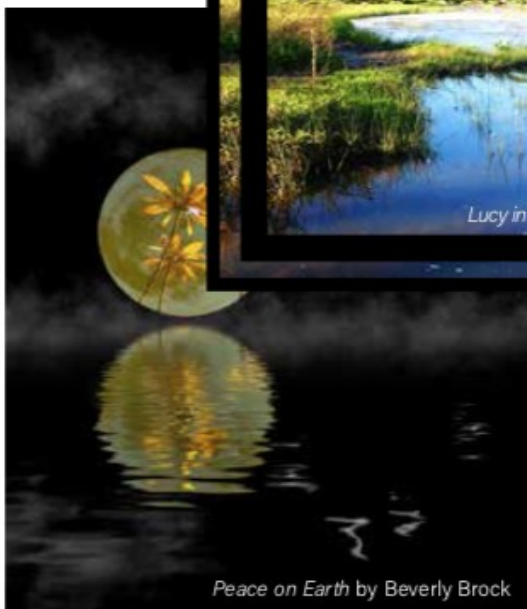
Peace on Earth by Beverly Brock