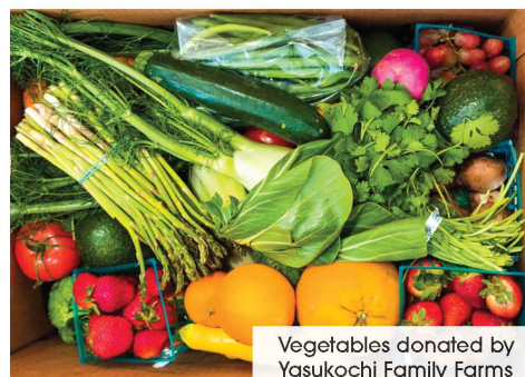
Vegetables donated by Yasukochi Family Farms